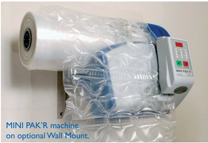
MINI PAK'R machine on optional Wall Mount.